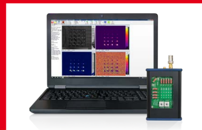
Perform Lock-in Method using a demonstrator