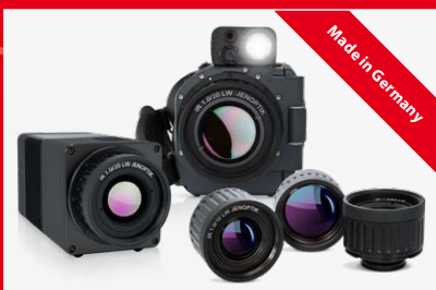
Numerous interchangeable lenses are available