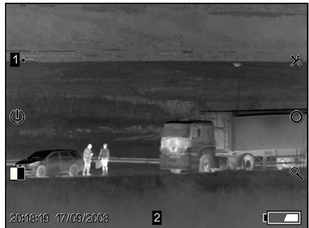
Surveillance and intelligence