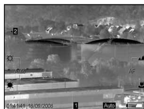
Civil defense and emergency management