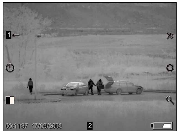
Surveillance and intelligence