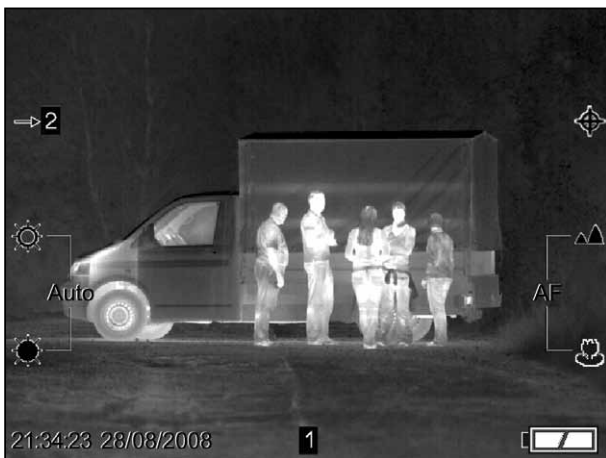
Identification of people in front of a vehicle