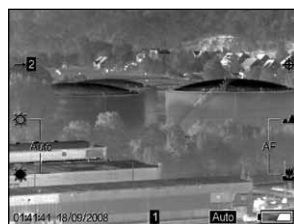
Civil defense and emergency management