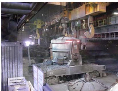
Ladle during casting process

Five precise and industrial-suited thermographic cameras now monitor all ladles during their way through the steelworks to the continuous caster. The cameras of the VarioCAM® high resolution series with their high geometric resolution can display even smallest defects and their outstanding thermal resolution allows for an early detection of thermal abnormalities already during the initial stages. On top of this, the temperature profile of the ladles can be traced over a long period of time via the software interface. The system has been adjusted to the harsh conditions of the foundry, for example by equipping it with solid protective housings, which ensure correct measurements by means of integrated air flushing. Temperature measurements and any occurring alerting are automatically matched with the respective ladles. Thus, ladle breakage can be prevented early on. With all this, ArcelorMittal Bremen minimises their economic risks as well as the hazards posed to their employee's health.