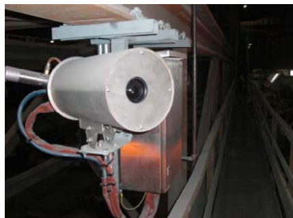
Thermal camera with protective housing